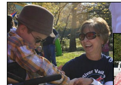
Celebrating our 40th Anniversary with a Family Fun Day at Ritter Park, October 2011