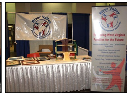
Below: Images from Celebrating Connections, February 2012